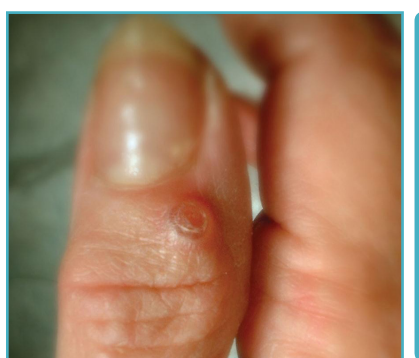
Figure 2: A ganglion cyst at the end joint of the finger, also known as a mucous cyst

Figure 1: A ganglion on the top side of the wrist